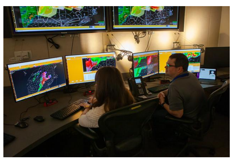
FY24 Notice of Funding Opportunity (NOFO)

produced by funded social science research projects. SPARK will play a pivotal role in advancing research through open science.